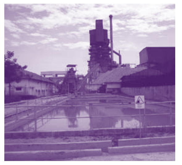
Quicklime Production Plant - Phase 2 (construction in progress)