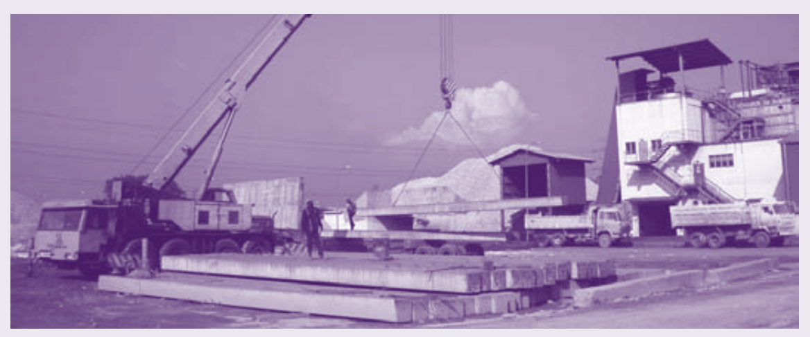
Hydrated Lime Production Plant (construction in progress)

The Group ended the financial year with net earnings of $$75.1 million, a 21-fold increase over net earnings of $$3.5 million last year. This increase was largely due to a $$75.9 million net gain resulting from the disposal of the entire equity interest in Anhui Jianghuai Automobile Co Ltd ("AJAC"), which was acquired by the Group in 2002, as well as a partial offset by currency translation losses of $$1.8 million.