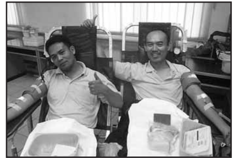
► Blood donation drive for Hospital Sultanah Aminah. ► Kempen derma darah untuk Hospital Sultanah Aminah.