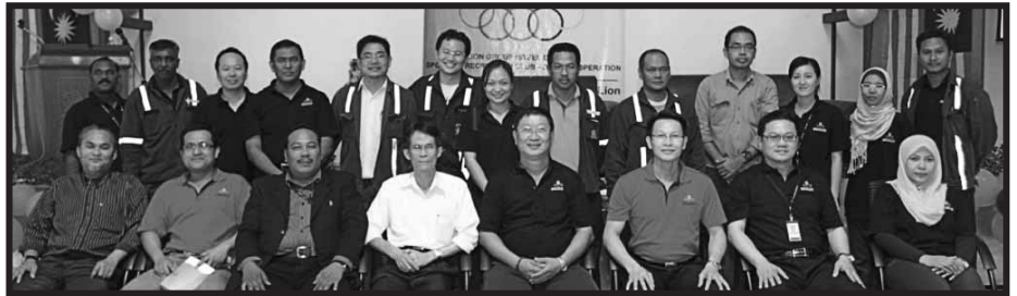
► Amsteel management with the new office bearers. ► Pihak pengurusan Amsteel dengan ahli jawatan kuasa baru.