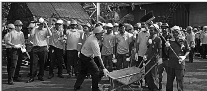
► All for one purpose: employees sprucing up Amsteel's premises. ► Untuk satu tujuan: kakitangan bekerjasama membersihkan persekitaran Amsteel.

All levels of staff from Amsteel Klang, Bright Steel Bukit Raja and contractors participated in the Gotong Royong with brooms, dustpans, spades, garbage bags, wheel barrows and such to spruce up the premises.