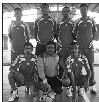
► Champion / Juara - Genius FC A.

Genius FC A emerged champion in the inter-department Futsal Tournament held on 25 Sept 2011. Second and third placing went to Rozita Che Wan FC and Genius FC B respectively.