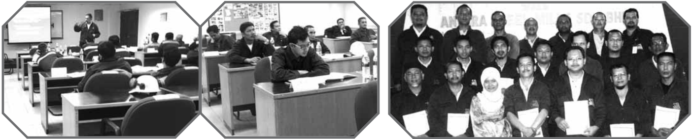
► Employees attending Antara's Safety Training Class in September and October 2011 respectively. ► Kakitangan menghadiri Latihan Keselamatan Kelas Antara pada September dan October 2011 masing-masing.