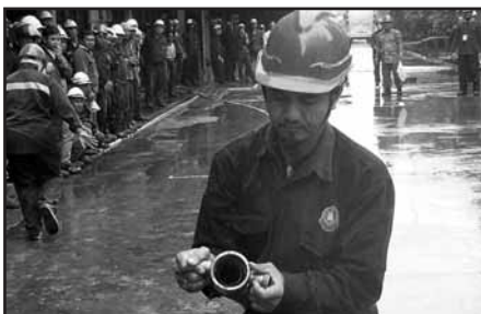
► The ER competition in progress. ► Pertanding ER sedang berlangsung.