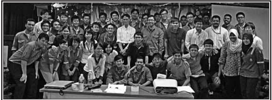
► New recruits and their HoDs are all smiles after a successful session. ► Rekrut baru dan Ketua Jabatan mereka tersenyum gembira selepas sesi yang berjaya.