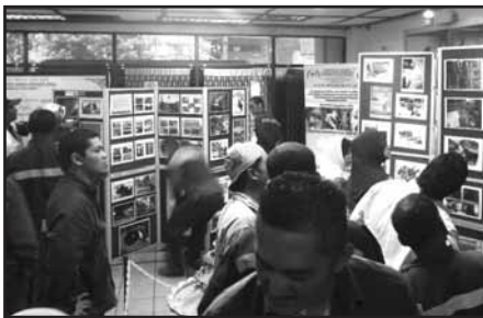
► Safety and health exhibition by the local authorities. ► Pameran keselamatan dan kesihatan oleh pihak berkuasa tempatan.

Among the activities organised were an exhibition and talks on safety and health by the local authorities, Emergency Response (ER) Team competition judged by Jabatan Bomba Pasir Gudang and blood donation drive for Hospital Sultanah Aminah which saw participation by 107 employees.