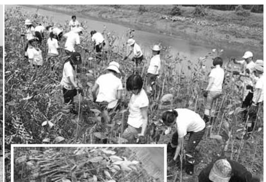
▶ Hand-in-hand in promoting "Beautiful Earth" campaign. ▶ Seiring dan sejalan mempromosi kempen "Bumi Indah".