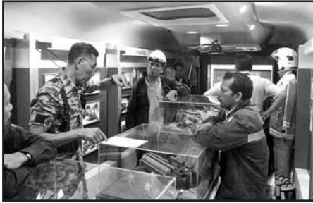
► Roadshow by Jabatan Bomba. ► Pameran Jabatan Bomba.

Among the activities organised were an exhibition and talks on safety and health by the local authorities, Emergency Response (ER) Team competition judged by Jabatan Bomba Pasir Gudang and blood donation drive for Hospital Sultanah Aminah which saw participation by 107 employees.