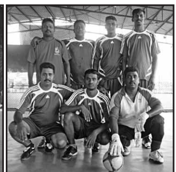
► 2nd Runner-Up / Ketiga - Genius FC B.