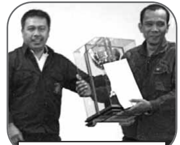
5S SECOND PLACING CRANE