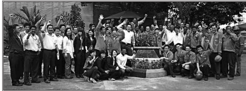
► Employees in high spirits at the launch of ISO 14001 certification. ► Kakitangan bersemangat di pelancaran ISO 14001.