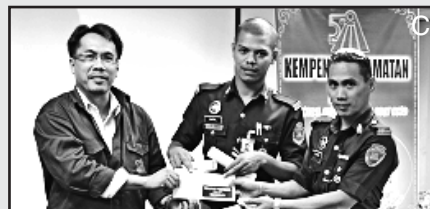
► Congratulations to ER competition winners / Tahniah kepada pemenang pertandingan ER: A) Kawad Kecekapan Kebombaan, B) Kawad Campuran Basah and C) Iron Man Category.