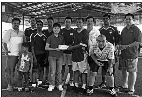
► Champion Team / Kumpulan Juara - Security Department.