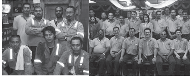
► SMP team happy to achieve World Class standard. ► Pasukan SMP berbangga dengan pencapaian Standard Dunia.