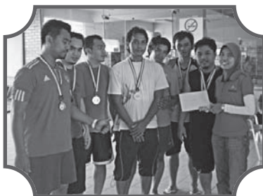
► 1st Runner-up/Kedua.