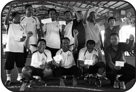
► Men's Champion/Juara Lelaki - SMP A.