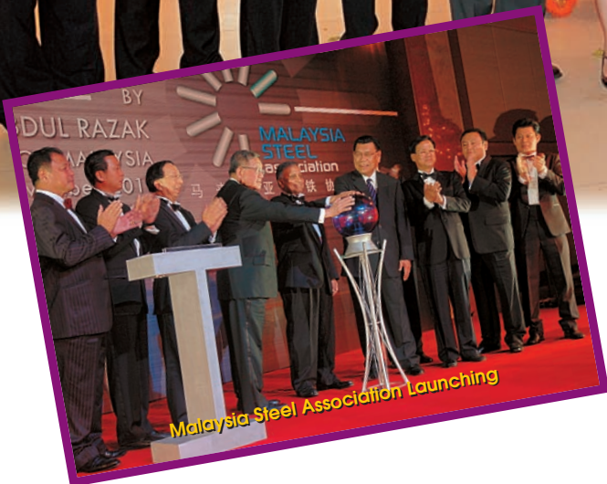
Malaysia Steel Association Launching