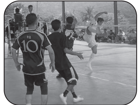
► Lubok Batu team with their winning form.