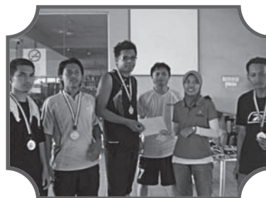
► 2nd Runner-up/Ketiga.

23 teams participated in the Megasteel Futsal Inter-Department Competition held at Ole Futsal Zetcom, Banting on 5 December 2010. SPNP Security FC emerged champion, while