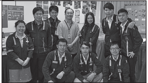
► USTB graduands manning the Steel Division display at Kuen Cheng School.

Our Steel Division companies exhibited their flat and long products at Kuen Cheng High School during the School Graduation Ceremony on 13 November 2010 to expose the students to steel making process and the importance of the steel industry. The Division also promoted its scholarships for study at University of Science & Technology Beijing (USTB) in China at the one-day exhibition coordinated by the first batch of USTB scholars who have graduated.