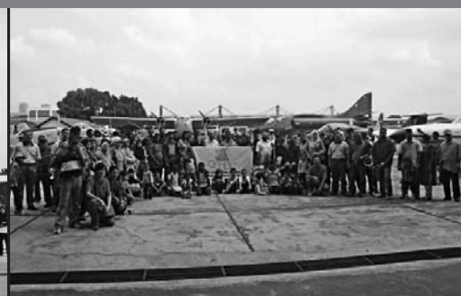
► Group photo at the National Monument (left) and TUDM (right). ► Gambar kenangan di Tugu Negara (kiri) dan TUDM (kanan).