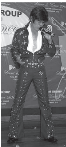
► Posim's very own "Elvis". ► "Elvis" Posim yang tersendiri.