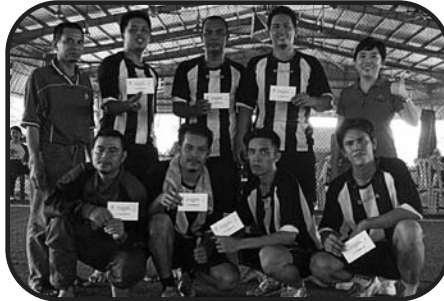
► 1st Runner-up/Kedua - BM 2'B'.