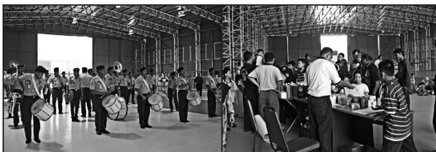
► TUDM band performing for our staff (left) and giving out souvenirs to the staffs' children (right). ► Persembahan dari pacaragam TUDM untuk kakitangan kita (kiri) dan memberikan cenderahati kepada kanak-kanak (kanan).