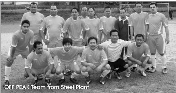
OFF PEAK Team from Steel Plant

Seven teams participated in a Soccer Tournament organised by Antara Steel Mills' Sports Club which was held from end November 2008 to January 2009.