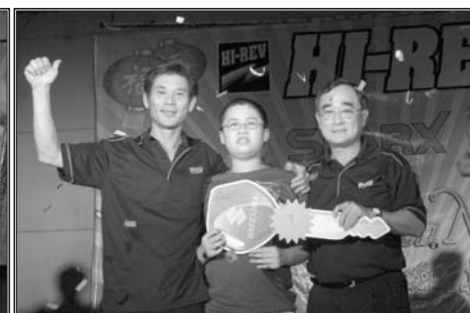
► Lucky draw winners who won great prizes including LCD TV and motorcycle. ► Pemenang cabutan bertuah membawa pulang pelbagai hadiah menarik termasuk TV LCD dan motosikal.