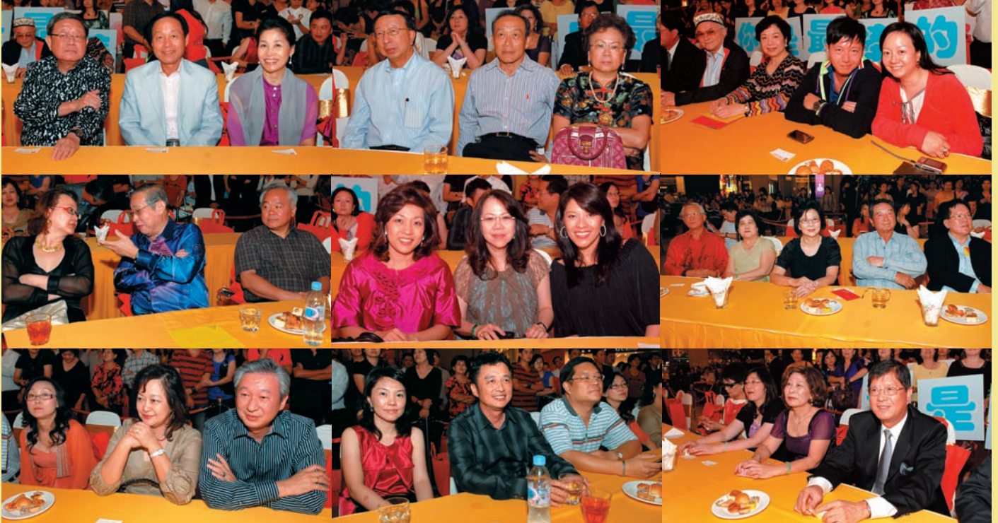
► Donors and sponsors at the Grand Finale Charity Show. ► Para dermawan dan penaja di Malam Penutup Tarian Amal.