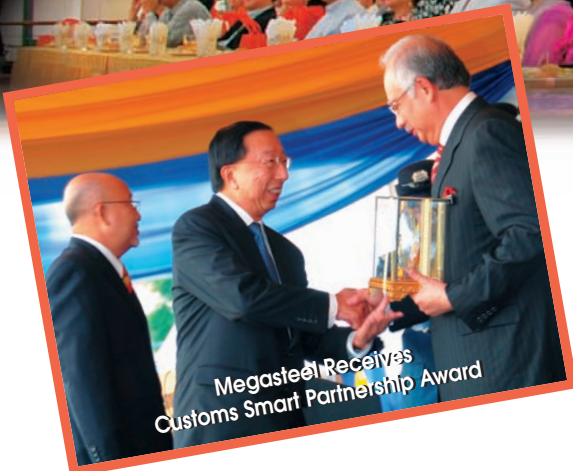
Megasteel Receives Customs Smart Partnership Award