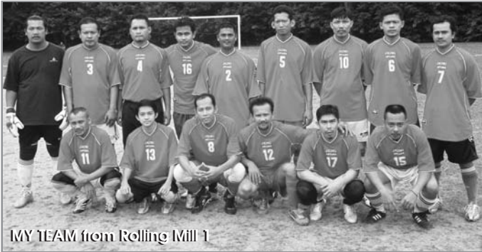
MY TEAM from Rolling Mill 1