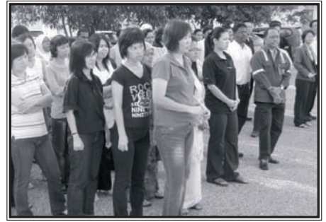
► Waiting for the roll call. ► Menanti untuk 'roll call'.