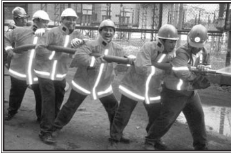
► Staff handling the hose to put out the fire. ► Kakitangan menggunakan hos untuk memadam kebakaran.

Amsteel Klang's Safety, Health and Environment Department recently conducted a Fire Fighting and a Fire Drill Exercise at its plant and office premises respectively. The exercise was a success with everyone evacuating the premises within three minutes after the alarm was sounded.