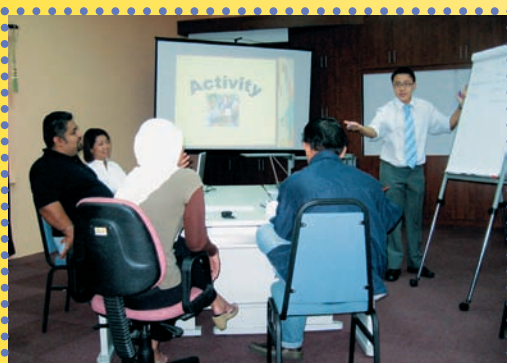
"Come on, throw out any ideas ... we need more" CBTE Instructor Certification at CEDR Corporate Consulting Sdn Bhd, 20 - 23 April 2009