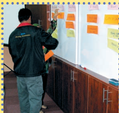
"Time is running out, we need to solve this puzzle as soon as possible" Certificate in Admin of Training at CEDR Corporate Consulting Sdn Bhd, 14 - 15 April 2009