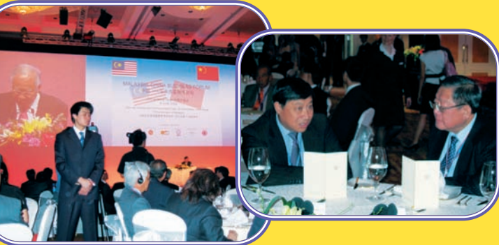
► At the Malaysia-China Business Forum. ► Sekitar Forum Perniagaan Malaysia-China.