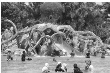
► Members and their families enjoying themselves at the park. ► Ahli dan keluarga mereka bergembira di Taman Air.