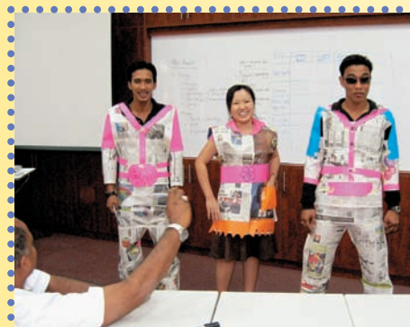
"This is the latest fashion in Malaysia. Do not hesitate to buy one for your loved ones" Personal Work Effectiveness for Amsteel Mills Sdn Bhd at CEDR Corporate Consulting Sdn Bhd, 8 - 9 April 2009