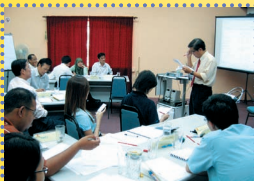
"Gosh, what a small print. I can't see the figures on this report" Interpretation of Financial Reports For Non-Financial Managers at CEDR Corporate Consulting Sdn Bhd, 29 May 2009