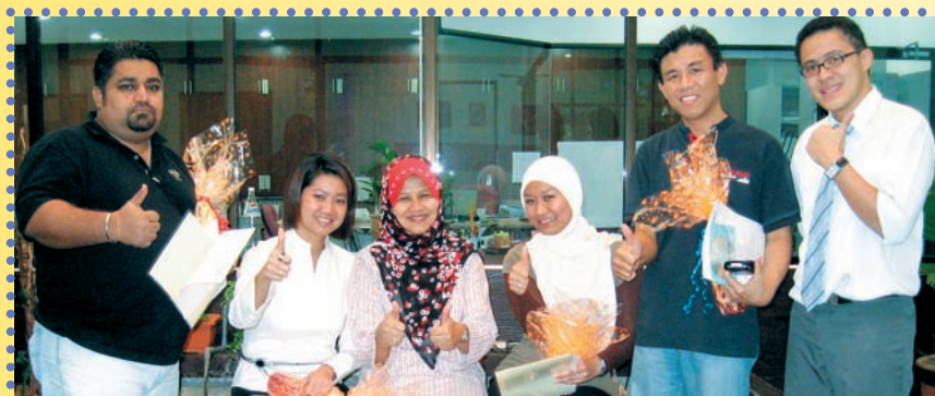
"This is the best training I have ever attended and I would recommend it to all my friends" CBTE Instructor Certification at CEDR Corporate Consulting Sdn Bhd, 20 - 23 April 2009