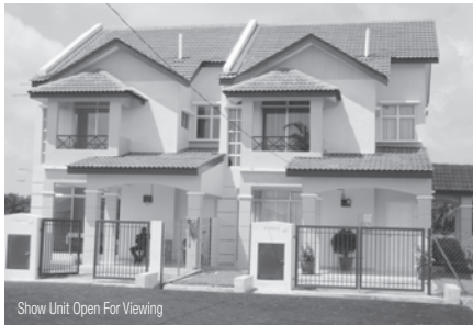
Show Unit Open For Viewing