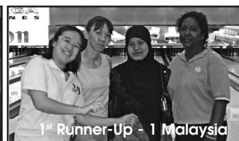
1st Runner-Up - 1 Malaysia