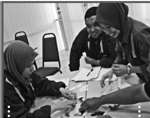
Megasteel, Connecting Others, Wisma Lion, 30 January 2012