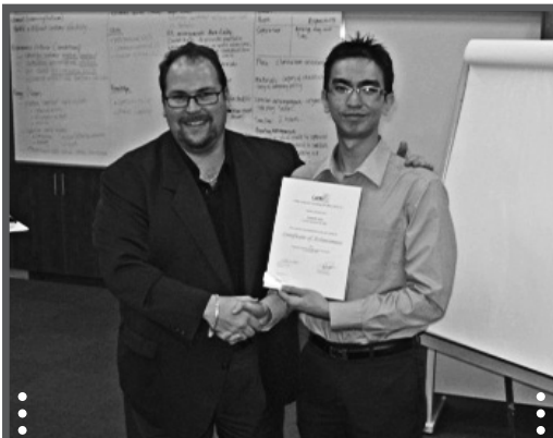
CBLT & Cert A training, CeDR, 5-8 December 2011

This is sooooo much fun, I wish we could do this the whole day!!