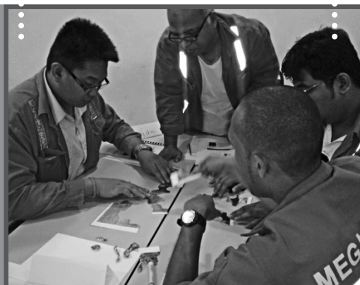
Let me shed some light for you people to see better