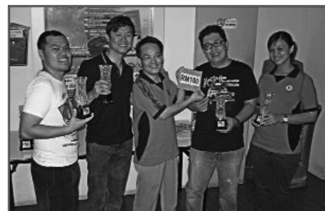
► 2nd Runner-Up/Tempat Ketiga - Transformers.

Team Fantastic Four beat 11 other teams to emerge champion in the bowling competition organised by Posim Sports Club on 14 April 2012. They walked away with RM300 cash prize and a trophy.