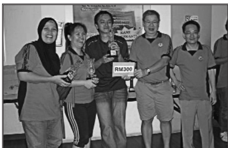
► Champion / Juara - The Fantastic Four.