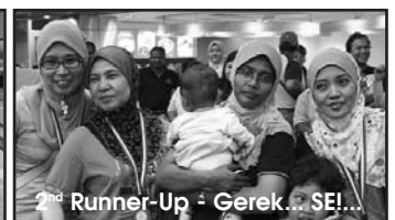
2nd Runner-Up - Gerek... SE!.