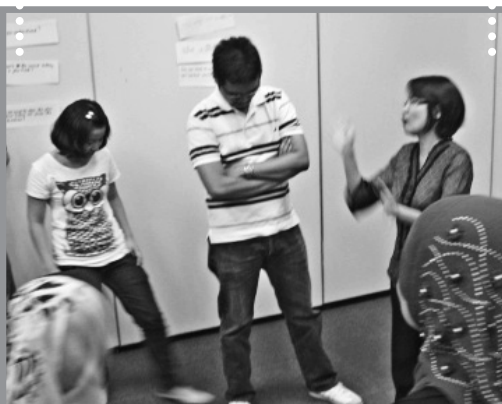
This is the right way to do tai chi... now mind your stance!