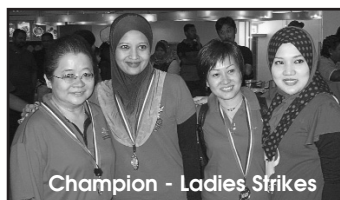
Champion - Ladies Strikes