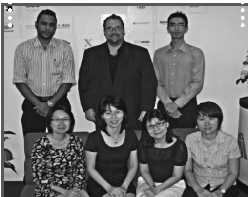
Faster take the picture la!