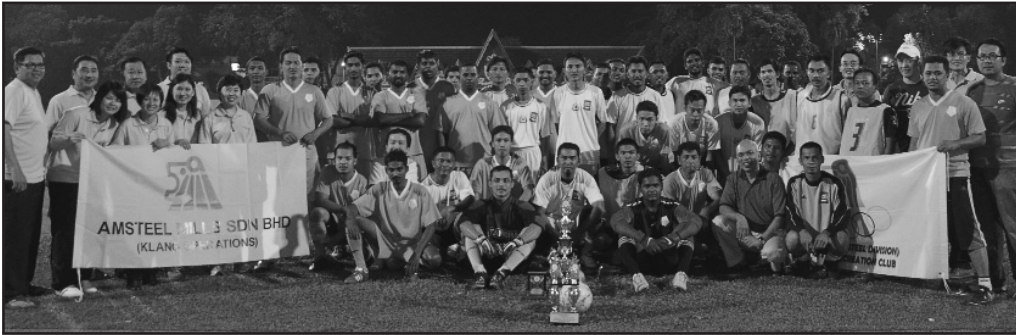
► Amsteel Klang and Linde Malaysia football teams together with their supporters. ► Pasukan bolasepak Amsteel Klang dan Linde Malaysia bersama penyokong.

Amsteel beat Linde Malaysia (formerly known as MOX Malaysia) 3 - 2 in a friendly football match held at Stadium Sultan Sulaiman, Klang on 23 March 2012. Both companies' Heads of Department and staff turned up to support their teams and took the opportunity to foster better working relations.