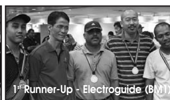
1st Runner-Up - Electroguide (BM1)