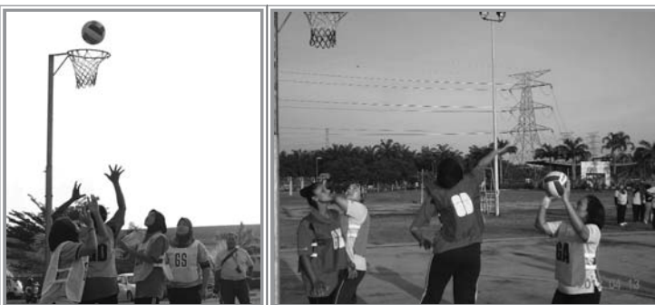
► Players in action. ► Para pemain sedang beraksi.