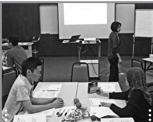
Nestle FLM Prog 3, CeDR, 9 December 2011