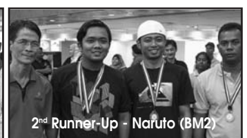
2nd Runner-Up - Naruto (BM2)