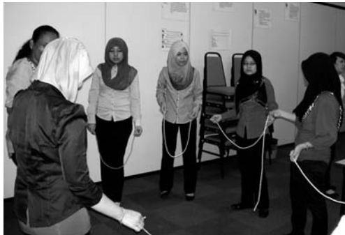
On the count of 3, let's skip together.