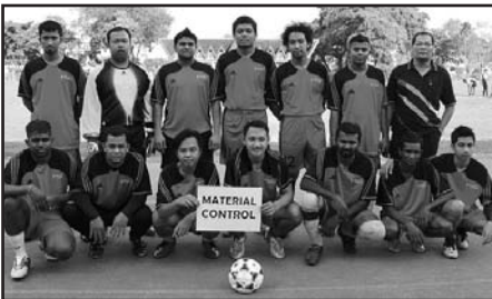
CHAMPION MATERIAL CONTROL