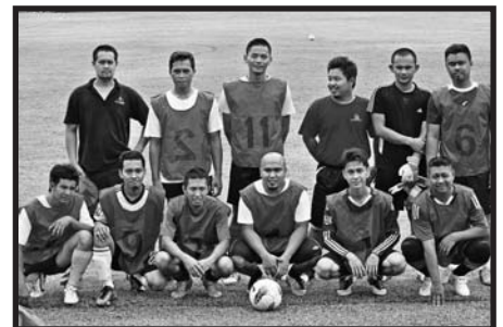
► 2 nd Runner-Up / Ketiga - Caster Park Rangers.