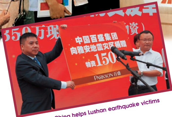
Parkson China helps Lushan earthquake victims