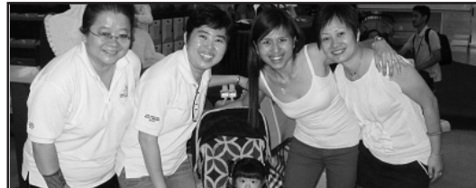
1 ST RUNNER UP LADIES STRIKES