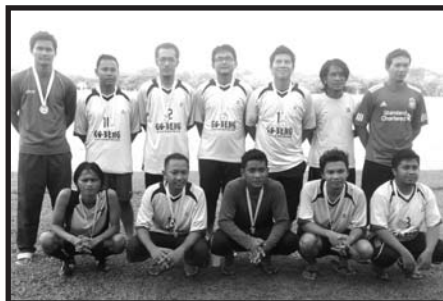
► 1 st Runner-Up / Kedua - Power Sangat FC.