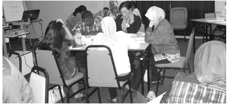
Oh gosh, I should have paid attention earlier.... How to answer this question???