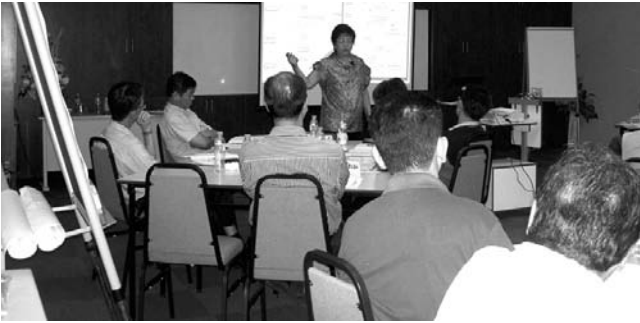
Strategic Balanced Scorecards Formulation & Facilitation Workshop, CeDR, 23 Feb 2013