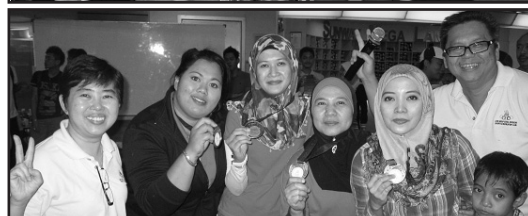
2 ND RUNNER UP MIXED GROUP