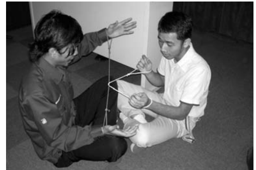
I believe we will be able to free ourselves.