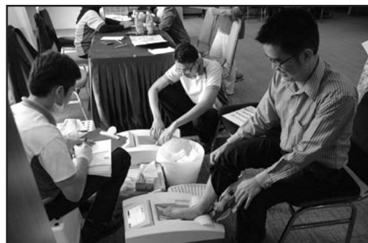
► Staff undergoing the "Bone Health Check" at Anlene's counter.