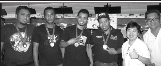
2 ND RUNNER UP LUCKY STRIKE (BM2)