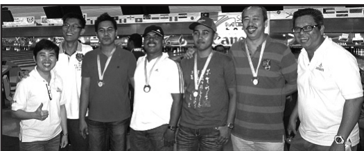
CHAMPION ELECTROGUIDE (BM1)