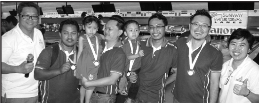
1 ST RUNNER UP SMP TEAM A