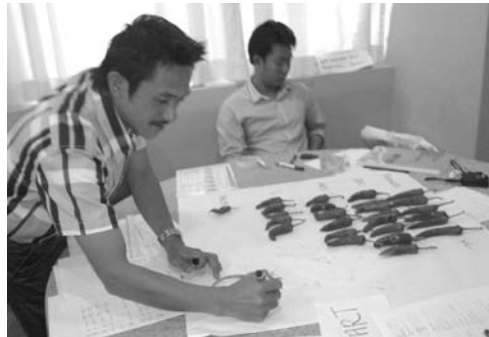
Wah... chillies, chillies, on the table... Which is the 'hottest' of them all?