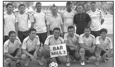
2 ND RUNNER UP BAR MILL 2