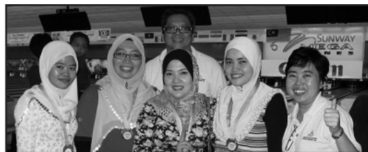
CHAMPION PINK LADIES