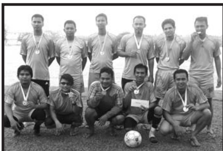
► Champion / Juara - Team Plan A.

About 200 people turned up at Kolej Mara Banting on 10 March 2013 for the Inter-Department Football tournament. Team Plan A from Lion DRI emerged Champion while Power Sangat FC and Caster Park Rangers from Megasteel Utilities/Automation Department and Caster Department took the second and third placing respectively.