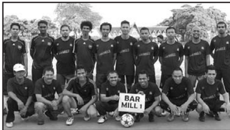
1 ST RUNNER UP BAR MILL 1