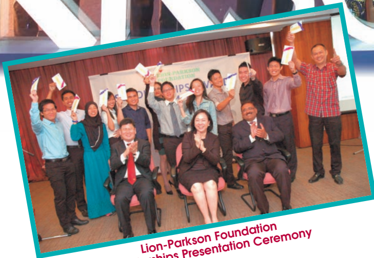
Lion-Parkson Foundation Scholarships Presentation Ceremony