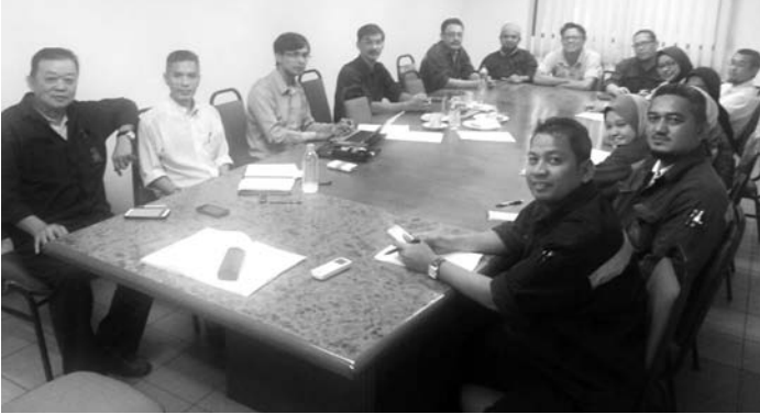
► Roundtable discussion between Antara team and Sirim officials. ► Perbincangan di antara pegawai pasukan Antara dan Sirim.

Sirim QAS International Sdn Bhd conducted a re-certification audit for Antara Steel Mills' ISO 9001:2008 on 14 and 15 August 2014.