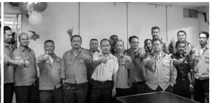
It is a thumbs-up for this programme .... It is the BEST!

Lion Group Certificate for Supervisory Development Programme (LGCSDP) Award Ceremony at Amsteel, Klang; 21 August 2014