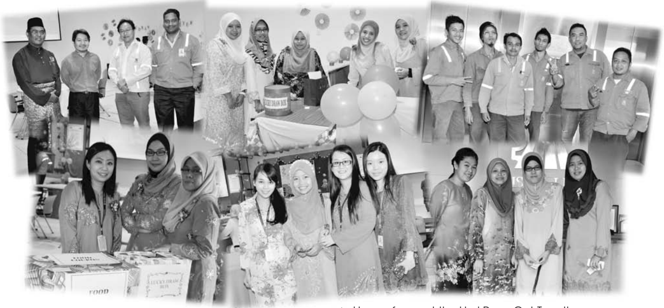
▶ Happy faces at the Hari Raya Get-Together. ▶ Wajah-wajah ceria di Majlis Hari Raya.

About 2,000 employees from Megasteel, Amsteel Banting, Lion DRI, Secomex, Compact Energy, Lion Tin, Lion Waterway, Lion Tooling, Singa Logistic and Bright Steel attended the Hari Raya Open House organised by Megasteel at Wisma Lion in Banting on 26 August 2014.