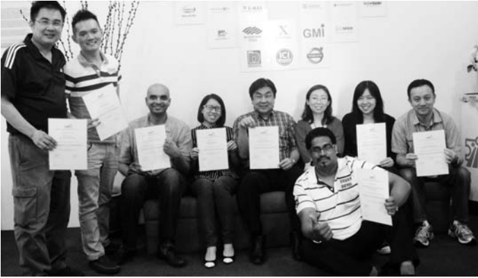
Wow, this is the proudest moment of my life!

Certificate IV in Training and Assessment - Competency Based Learning Designer & Assessor at CeDR, 21-22 May 2014