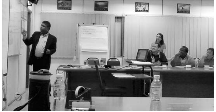
Please look here! This is how problems are handled to avoid high absenteeism.

Certificate IV in Training and Assessment - Competency Based Learning Designer & Assessor at CeDR, 21-22 May 2014