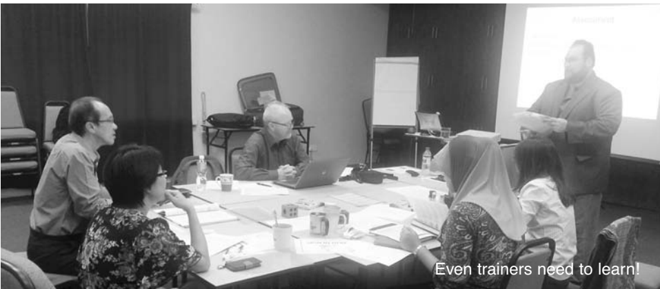
Even trainers need to learn!

How To Practically Manage Absenteeism, Late Coming & Medical Leave at Amsteel, Banting; 14 May 2014