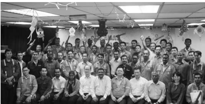
Hip, hip, hooray! Finally, we have graduated!

CeDR trainers being updated by our Australian Certification partner (MRWED) on new developments for the certification programme, 3 March 2014