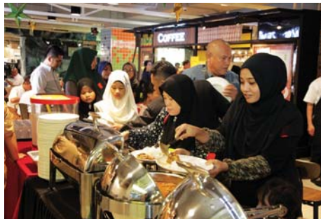
► Enjoying the nasi padang spread for 'buka puasa'. ► Menikmati nasi padang untuk berbuka puasa.