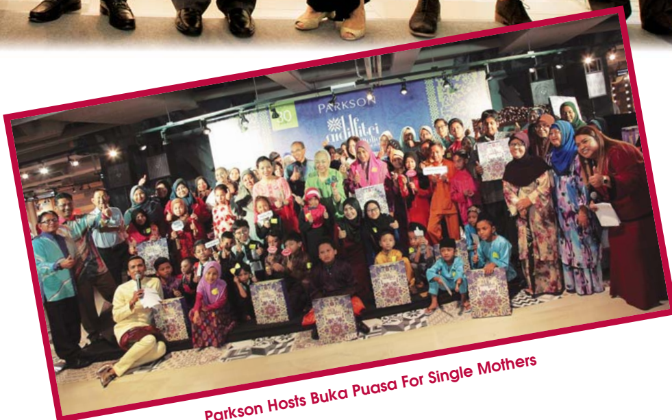
Parkson Hosts Buka Puasa For Single Mothers