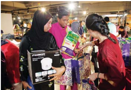
► Single mothers with their families being presented with the Raya goodies. ► Ibu tunggal dan keluarga menerima cenderamata Hari Raya.