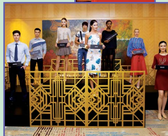
► Live Mannequin Show by Parkson.