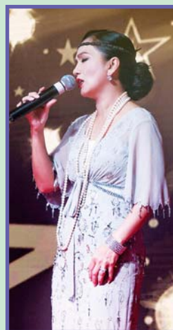
► Performances by Dato' Sheila Majid (left photo) and World Funniest Man, Harith Iskander (right photo).