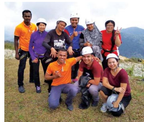
Group shot after the challenges

The CeDR team took a couple of days off at Best Western Premier Ion Delemen, Pahang to challenge themselves to step out of their comfort zone – and step out they did! There was a spot of Flying Fox, Rope Walking and Wall Climbing. Later on they ran around the peak in a treasure hunt designed to familiarize themselves with everything available there, had their Christmas gift exchange, and ended with their monthly meeting to take stock of where they are, and to strategise where they want to be.