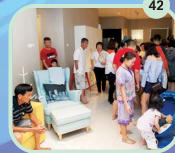
Lion Property organised a preview of Resilion Residence project at its Bandar Mahkota Cheras Sales Gallery on 14 & 15 October 2017.