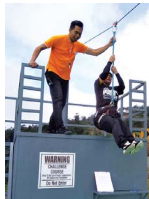
Kak Ana gamely shooting off the base