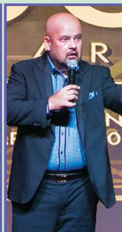
► Persembahan oleh Dato' Sheila Majid (gambar kiri) dan Pelawak Dunia, Harith Iskander (gambar kanan).