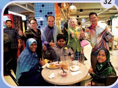
Parkson hosted its first Majlis Iftar Ramadan for 30 single mothers from Selangor, Kuala Lumpur and Negeri Sembilan and their children at Makan Makan by Parkson in fahrenheit88 on 8 June 2017.