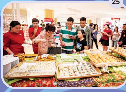
Parkson KLCC hosted a Raya Open House for its business associates and Parkson Card members on 19 May 2017.