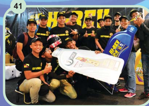
Hi-Rev participated in the Kuching International Bike Week 2017 (KIBW 2017) at CityOne Megamall from 12 to 15 October 2017.