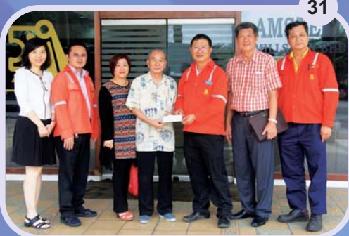
For the 11 th consecutive year, Lion-Parkson Foundation contributed to Taman Klang Residents Association's Annual Education Program represented by Amsteel Mills.