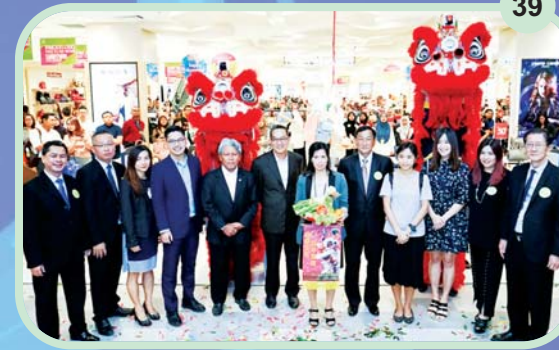
Parkson Kuantan City Mall, the second Parkson store in Kuantan opened its doors on 12 October 2017.