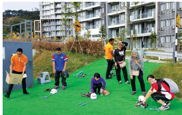
Preparing for the challenges