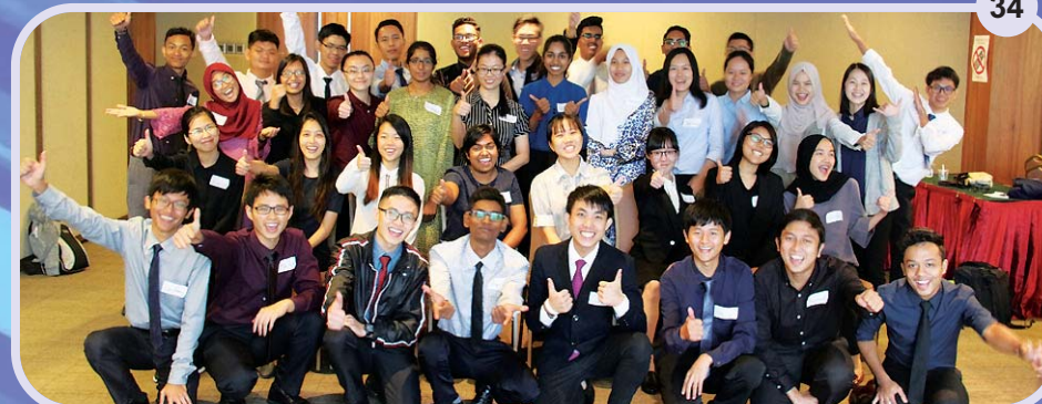
Lion-Parkson Foundation organised a briefing session on 15 June 2017 for the shortlisted candidates for its scholarship awards.