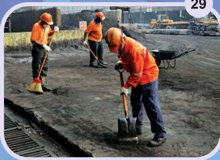
Amsteel Mills ISO 14001 Committee organized two "Gotong Royong" sessions to promote environmental awareness amongst the employees and a conducive working environment prior to the ISO 14001 EMS Audit by SIRIM.