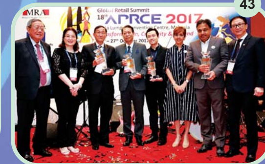
Parkson won the 'Most Innovative Retail Concept Award' at the 18 th Asia Pacific Retailers Convention & Exhibition (APRCE) held in Kuala Lumpur Convention Centre from 25 to 27 October 2017.