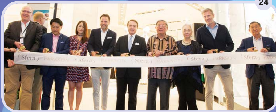
Spanish youth-oriented fast fashion brand, Sfera officially opened its 1 st store in Malaysia on 13 May 2017.