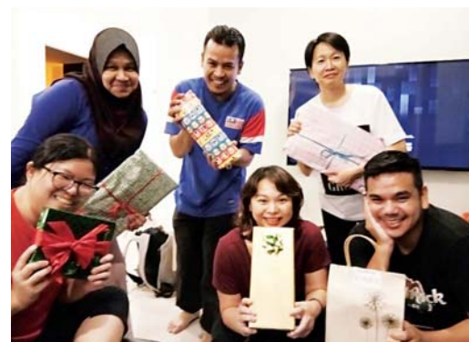
The team with their gifts

The CeDR team took a couple of days off at Best Western Premier Ion Delemen, Pahang to challenge themselves to step out of their comfort zone – and step out they did! There was a spot of Flying Fox, Rope Walking and Wall Climbing. Later on they ran around the peak in a treasure hunt designed to familiarize themselves with everything available there, had their Christmas gift exchange, and ended with their monthly meeting to take stock of where they are, and to strategise where they want to be.