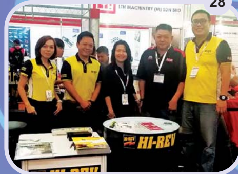
Lion Petroleum Products participated in Asean's largest International Machine, Tool & Metalworking Technology Exhibition, Metaltech Malaysia 2017 from 24 to 27 May 2017.