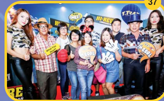
About 1,500 dealers and their family members, and guests attended Hi-Rev's Family Day organised by Posim Petroleum Marketing on 12 August 2017.