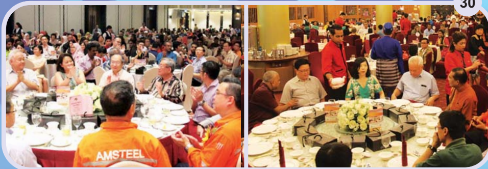
Amsteel Mills hosted two staff dinners themed "Malaysia Traditional Nite" on 2 May and 11 May in appreciation of its employees for their dedication and commitment in increasing production and meeting production targets.