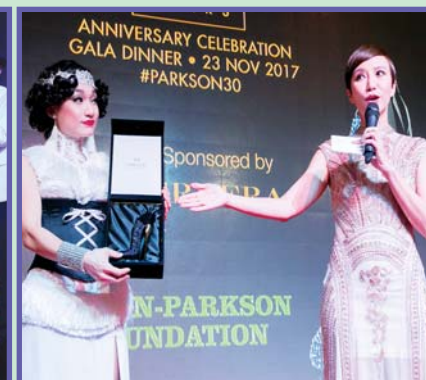
► Charity auction of Datuk Wira Lee Chong Wei's specially autographed paraphernalia (left photo) and Carolina Herrera's special Good Girl Perfume (right photo), with proceeds going to Lion-Parkson Foundation in aid of charity.