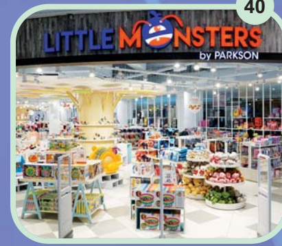
Little Monsters by Parkson, the latest children playground was opened at 3 rd Floor, DA MEN Mall in USJ Subang Jaya.