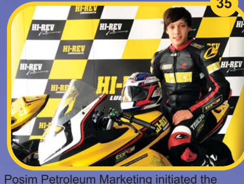
Posim Petroleum Marketing initiated the Hi-Rev Young Talent Program in support of disciplined, hardworking and talented youths who are actively participating in competitive motorsports activities.