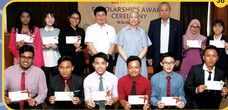
Lion-Parkson Foundation awarded scholarships totalling RM410,000 to 9 deserving students based on academic performance, extra-curricular activities and leadership qualities on 18 August 2017.