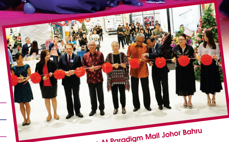
Parkson Opens At Paradigm Mall Johor Bahru