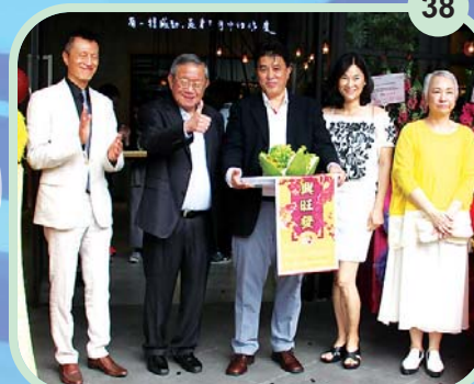
Hogan Bakery held its grand opening ceremony at its Lion Office Tower outlet on 21 September 2017.