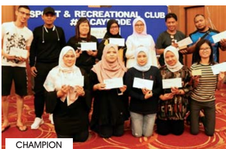
▶ Blue team