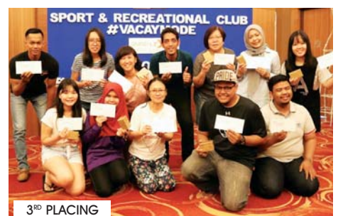
▶ Red team