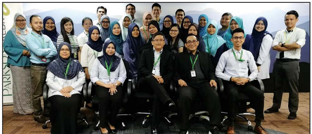
► Credit Evaluation and Processing Department occupies Level 7 in Menara PMI. ► Jabatan Penilaian Kredit dan Pemerosesan terletak di Tingkat 7, Menara PMI.