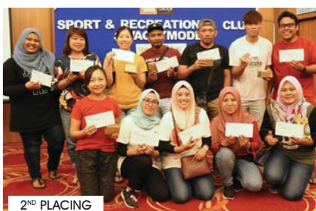
▶ Pink team