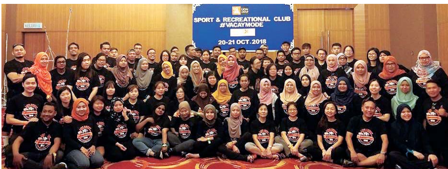
▶ An opportunity to get to know each other better. ▶ Kesempatan untuk lebih mengenali satu sama lain.