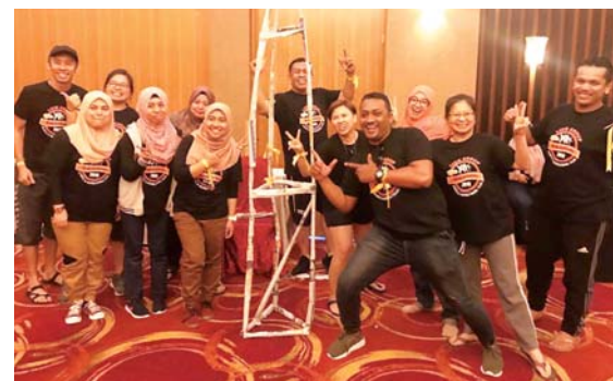
▶ Yellow team with their newspaper tower. ▶ Pasukan Kuning bersama 'menara surat khabar' mereka.