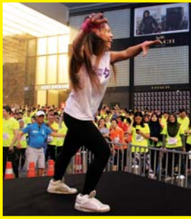
▶ Warming-up session. ▶ Sesi memanaskan badan.