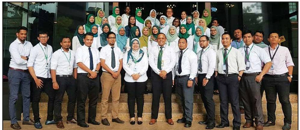
► Credit Management Department staff in a group photo at the front of Menara PMI. ► Warga kerja Jabatan Pengurusan Kredit bergambar di hadapan Menara PMI.

The entire Credit Evaluation/ Processing and Credit Management Departments are also involved in the relocation. The new office with more space, which is just adjacent to its Headquarters at Lion Office Tower in Jalan Nagasari will help increase the efficiency of operations, and provide for additional growing space for the Company in the future.