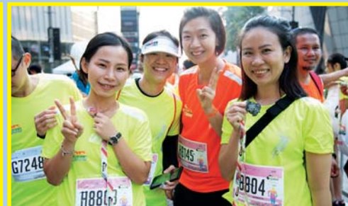
▶ Happy to run for charity and have fun at the same time. ▶ Gembira berlari sekadar untuk tujuan amal dan berseronok pada masa yang sama.