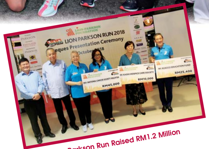
Lion Parkson Run Raised RM1.2 Million