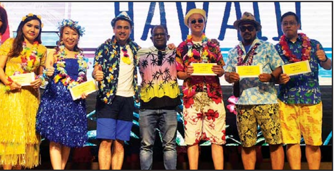
▶ Top three best dressed in the male and female categories with their prizes. Pakaian terbaik tiga teratas kategori untuk lelaki dan wanita bersama hadiah yang dimenangi.