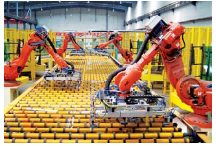
Al and Industry 4.0

ever-changing market, AI algorithms formulate estimations of market demands through patterns linking location, socioeconomic and macroeconomic factors, weather patterns, political status, and consumer behavior. This data is