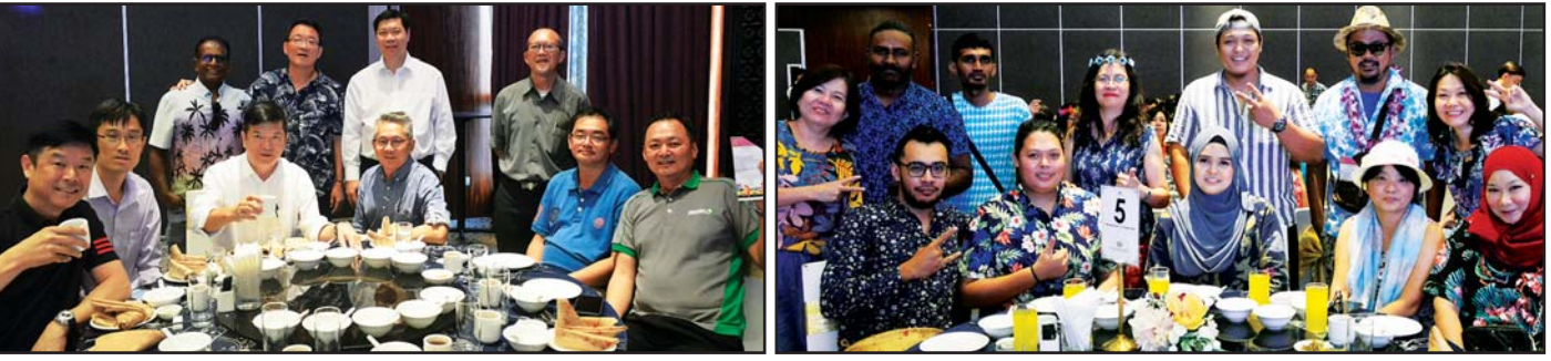
Everyone enjoyed themselves and happily posed for photographs. ▶ Semua orang menikmati diri sendiri dan bersuka ria mengambil gambar

In line with the theme, many members came dressed in colourful outfits complete with floral aarlands. Lucky members also took home prizes comprising cash and electrical items from the lucky draw.