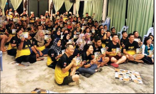
▲ taff of Posim Petroleum Marketing and Lion Petroleum Products congregated at Gopeng, Perak for the HI-REV Team Building and Motivation Retreat from 14 to 16 July 2019.

The 3-day retreat with the theme, "We Create Winning Teams Together" with their business partners and associates focused on building self awareness and being more effective team players.