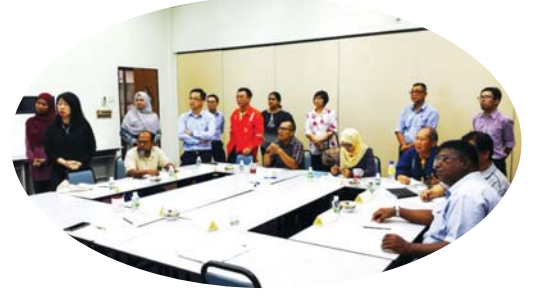
Pre-briefing to set the tone of the focus group discussion.

itled "Shaping up the Leadership Development, Succession Planning and Talent Management in Lion Group", CeDR hosted various HOD members from across the Group on 20 June 2019 to discuss the Learning and Development landscape of the Group and how it helps shape the development of employees' career advancement.