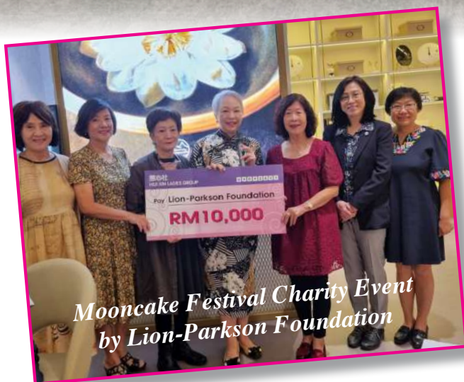
Mooncake Festival Charity Event by Lion-Parkson Foundation