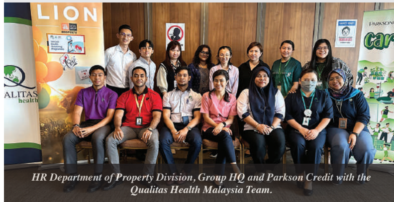
HR Department of Property Division, Group HQ and Parkson Credit with the Qualitas Health Malaysia Team.